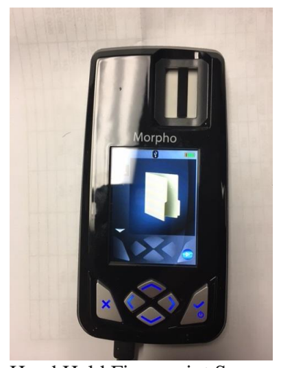
Hand Held Fingerprint Scanner